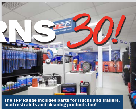
The TRP Range includes parts for Trucks and Trailers, load restraints and cleaning products too!