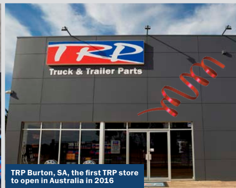
TRP Burton, SA, the first TRP store to open in Australia in 2016

This year marks the 30th anniversary since the introduction of PACCAR's global aftermarket brand, TRP, in The Netherlands. Since then, the brand has expanded to other markets worldwide, including its launch in Australia in May, 2013.