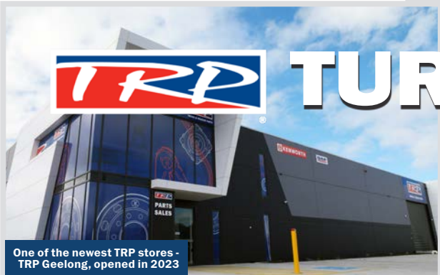
One of the newest TRP stores - TRP Geelong, opened in 2023